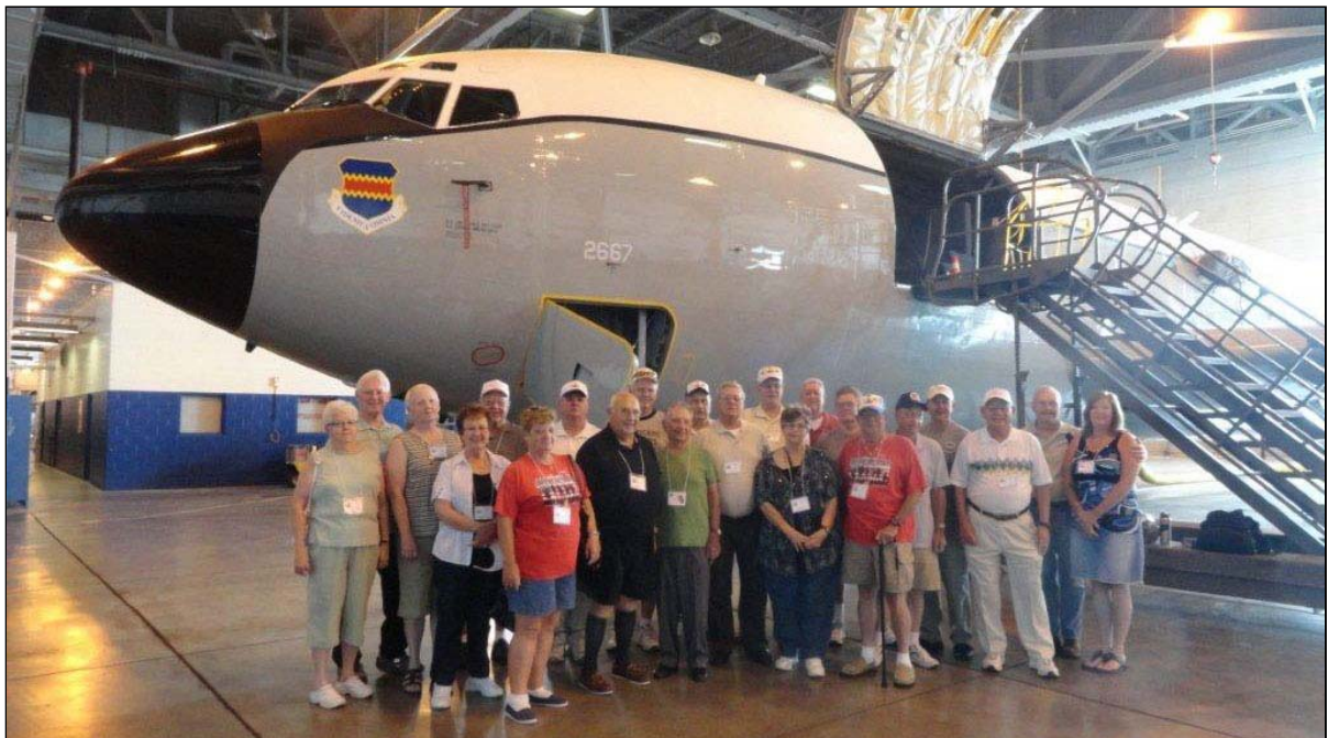
Thank you to the men and women of the 45th Reconnaissance Squadron and Det 1, AFTAC, for the great tour of WC-135W 61-2667. Seeing the current technology upgrades, and hearing first hand accounts of sampling against the Japan nuclear crisis after the 2011 tsunami, was both interesting and eye opening.